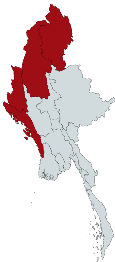
Map of the areas most affected by food insecurity (Chin, Kachin and Rakhine, Sagaing)

Food insecurity continues to escalate in Myanmar. More and more people are unable to afford food due to increasing costs and inflation, as well as due to floodings and other extreme weather events such as Typhoon Yagi. Prices of basic foods have increased by 30% last year alone (5) . It is projected that the amount of people suffering food insecurity will increase in 2025 by 1.7 million people, according to the WFP.